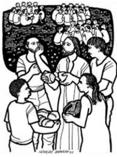
Feeding of the five thousand