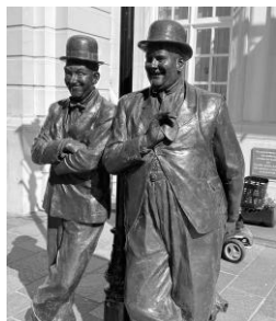
Another fine mess